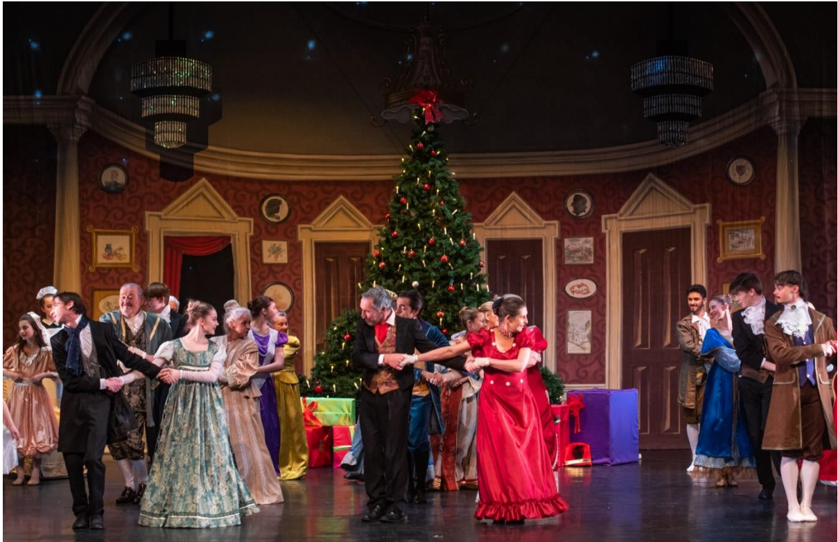
Local adults and children, with professional dancers, in the party scene in Act 1