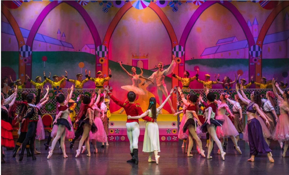
Kingdom of Sweets

In December 2019, Brecon Festival Ballet (BFB) presented a full-scale production of “The Nutcracker” at Theatr Brycheiniog in Brecon, that clocked up a number of firsts. It was the first time that a full-scale production of this iconic ballet had been created in Wales. It was the first time that Theatr Brycheiniog had hosted a ballet company with a professional live orchestra in the pit. It was the first opportunity for many Wales-based classical ballet dancers to showcase their talents in their home nation. And for many of the audience members, it was the first time they had been able to see a famous, full-scale classical ballet in their hometown, without having to travel to a city to see such a spectacle.